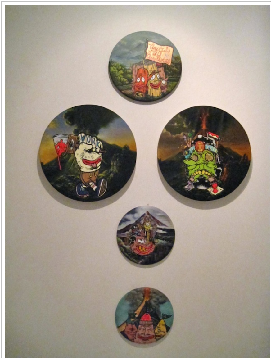
Uji Handoko, 'Meet the legend', 2012, acrylic on canvas, variable dimensions.