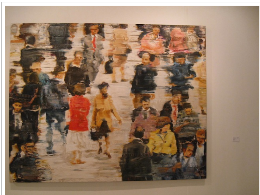
Aan Arief Rahmanto, 'Bustle of the city', 2012, oil on canvas, 200 x 250 cm.