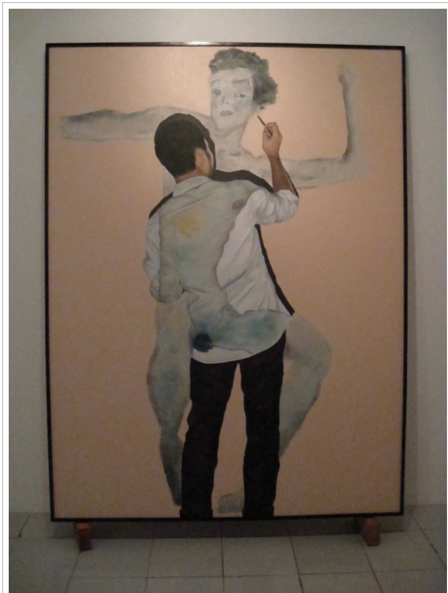
Theo Frids Hutabarat, 'The Imposter', 2012, oil on canvas, 200 x 150 cm.