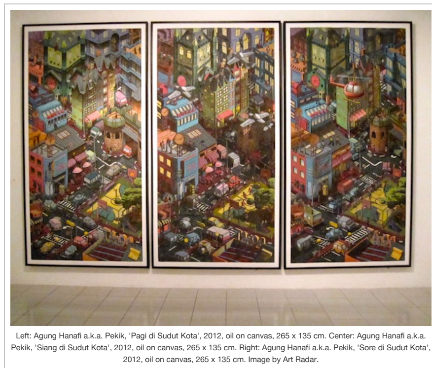
Left: Agung Hanafi a.k.a. Pekik, 'Pagi di Sudut Kota', 2012, oil on canvas, 265 x 135 cm. Center: Agung Hanafi a.k.a. Pekik, 'Siang di Sudut Kota', 2012, oil on canvas, 265 x 135 cm. Right: Agung Hanafi a.k.a. Pekik, 'Sore di Sudut Kota', 2012, oil on canvas, 265 x 135 cm.